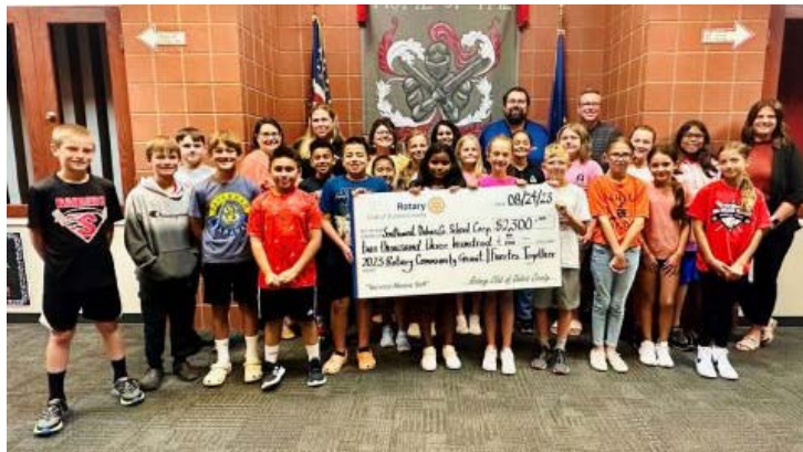
Grant awarded to Southwest Dubois County School Corporation for biliteracy program.

Rotary Club of Dubois County donates $9,000 to local area Nonprofits